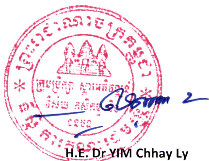
H.E. Dr YIM Chhay Ly

Deputy Prime Minister Chairman of the Council for Agricultural and Rural Development and Chairman of the Technical Working Group for Food Security and Nutrition